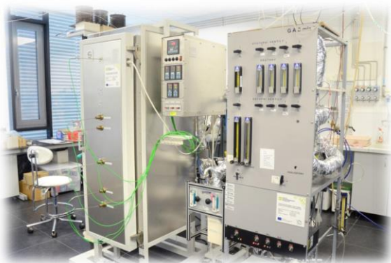
Catalyst testing unit in the Laboratory of air protection