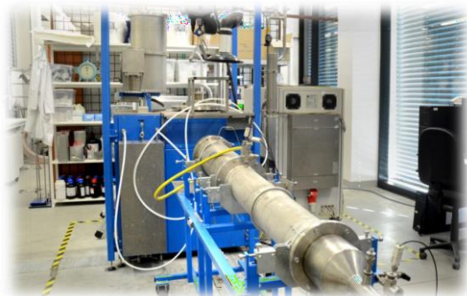
System for thermal disposal of hazardous wastes