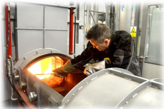
Continuously operating pilot-scale waste incinerator